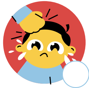
Hurting a classmate