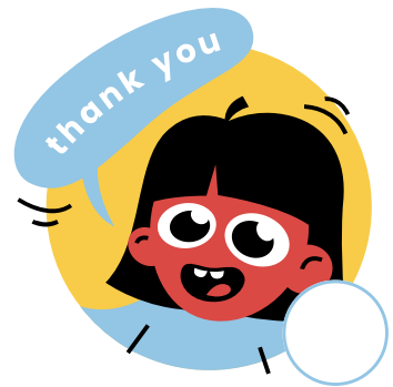
Saying "thank you."