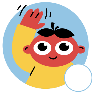
Raising a hand to ask questions