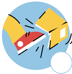
Making a mess