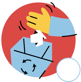
Throwing trash in the bin