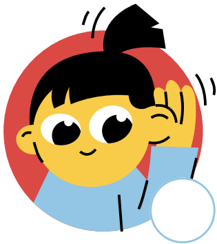
Listening during class

Who among the following kids are following the classroom rules? Give them stars for a job well done.