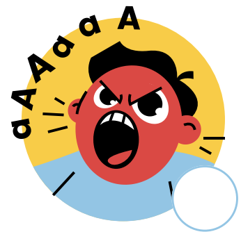
Screaming or yelling in class